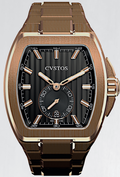
METROPOLITAN PS 5N RED GOLD / BLACK DIAL / LTD 25 PCS F01103.4222001 ON REQUEST