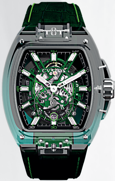
METROPOLITAN PS SAPPHIRE / S/TL GREEN DIAL / LTD 50 PCS F00103.4287001 35'000 Chf-