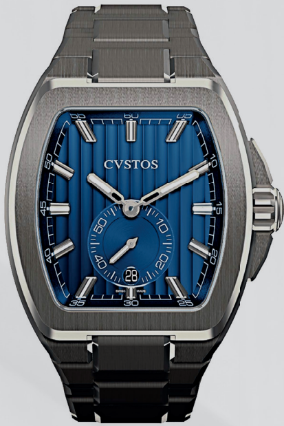
METROPOLITAN PS TITANIUM / BLUE DIAL / LTD 200 PCS F01103.4213001 12'000 Chf-