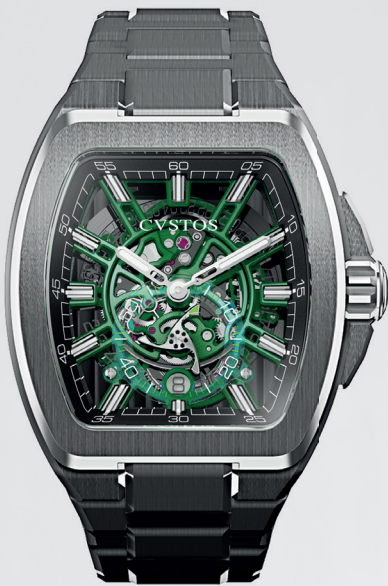
METROPOLITAN PS TITANIUM / S/TL GREEN DIAL / LTD 200 PCS F00103.4217001 18'500 Chf-