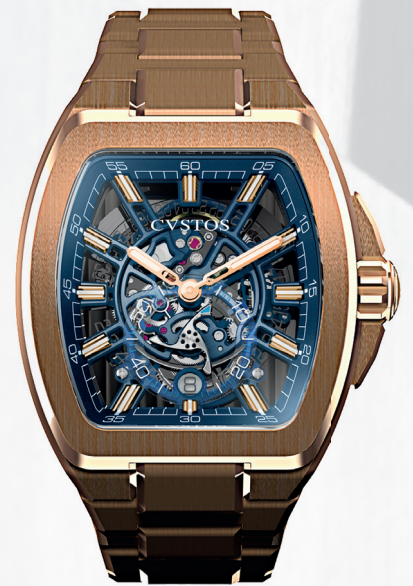
METROPOLITAN PS 5N RED GOLD / S/TL BLUE DIAL / LTD 25 PCS F00103.4223001 ON REQUEST